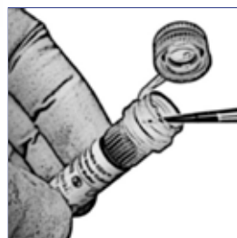
Mix the positive blood culture sample with buffer

Assay steps for the GenomEra MRSA/SA Blood Culture test: