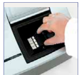
Start the GenomEra CDX assay run