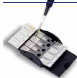
Pipette to test chips